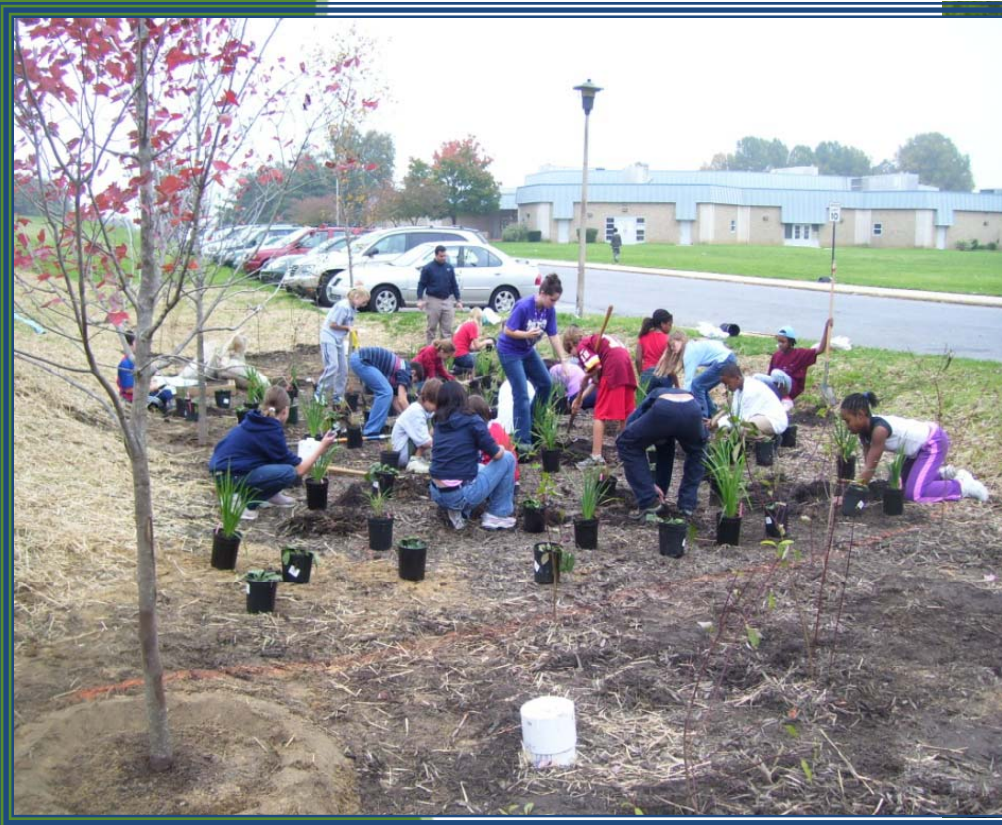
Burleigh Manor Middle School, Howard County 7th Graders Planting a Bioretention Area

Conserving and Enhancing the Natural Environment on School Sites