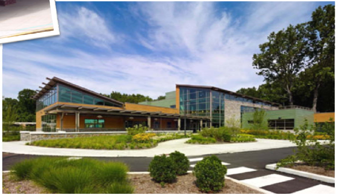
Literacy Center Springfield School District