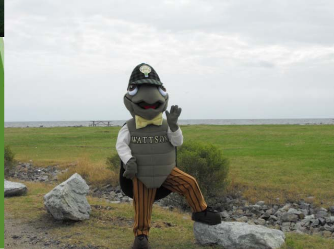
Evergreen Elementary, St. Mary's County