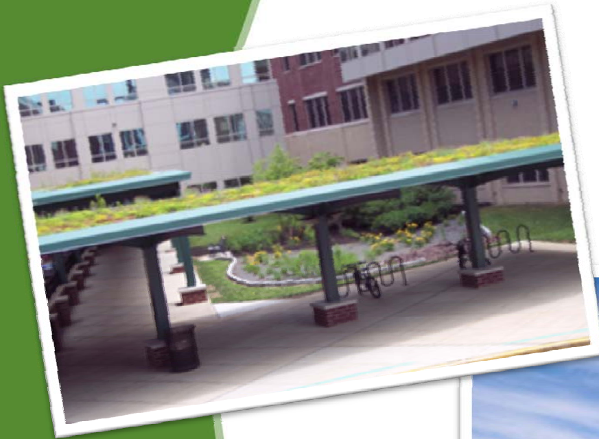
Middle School Radnor Township School District