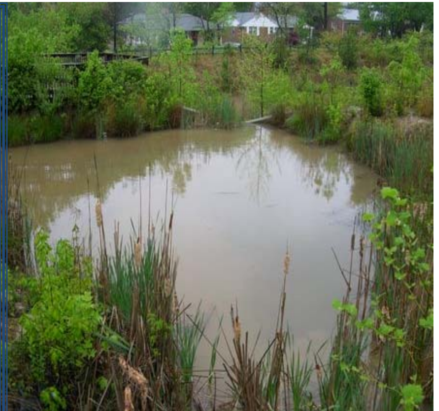
Mary Harris "Mother" Jones Elementary, Prince George's County Wetlands Environmental Study Area