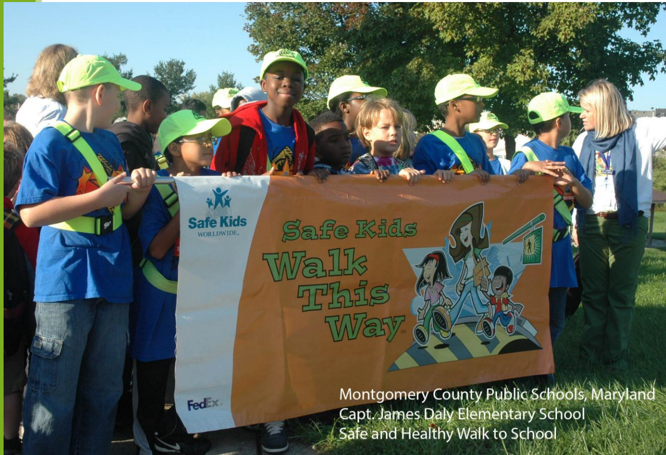
Montgomery County Public Schools, Maryland Capt. James Daly Elementary School Safe and Healthy Walk to School