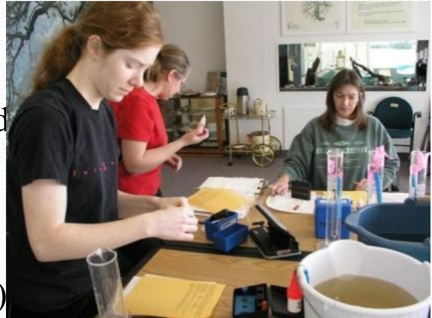
Alliance for the Chesapeake Bay Member Recertification Event