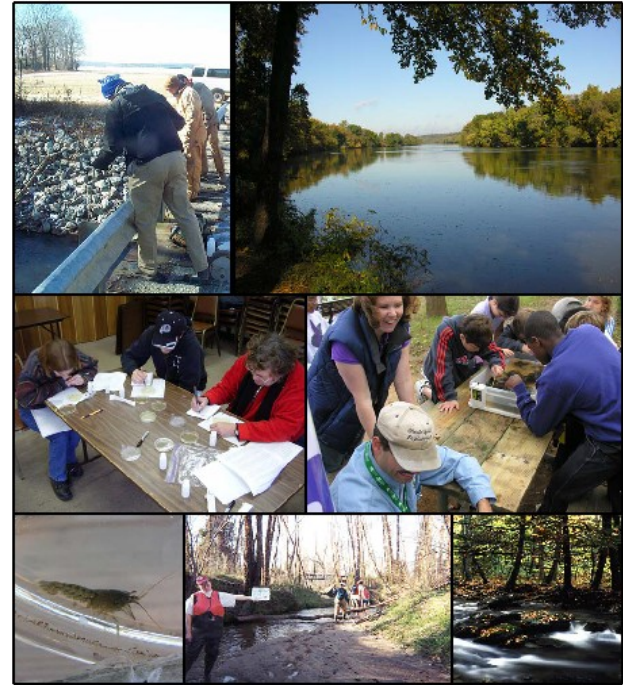
Virginia Citizen Water Quality Monitoring Program Methods Manual October 2007