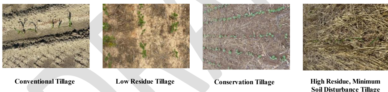
Figure 1. Examples of tillage practices in agricultural fields. Only fields with over 15% crop residue coverage immediately after crop planting are considered BMPs in the CBP. Specific land use types that are eligible for conservation tillage BMPs in the CBP include full season soybeans, grain with manure, grain without manure, silage with manure, silage without manure, small grains and grains, double cropped land, and specialty crops. Images from "Virginia Tillage/Residue Survey – Using an Alternative Approach for Verification." 7

To receive TMDL credit for the nutrient and sediment reductions afforded by conservation tillage BMPs, CBP reporting agencies (e.g., Pennsylvania Department of Environmental Protection) must regularly survey and quantify conservation tillage BMP implementation in accordance with the procedures set forth in the Chesapeake Bay Program's BMP verification guidance documents. The existing methodologies for conservation tillage BMP verification in the Chesapeake Bay Watershed are documented in "Recommendation Report for the Establishment of Uniform Evaluation Standards for Application of Roadside Transect Surveys to Identify and Inventory Agricultural Conservation Practices for the Chesapeake Bay Program Partnership's Watershed Model" 5 and "Virginia Tillage/Residue Survey - Using an Alternative Approach for Verification." 6 While effective, these methods are expensive and time consuming, requiring surveyors to drive thousands of miles throughout each jurisdiction of the Chesapeake Bay Watershed to manually classify the tillage regimes implemented in a sub-sample of agricultural fields.