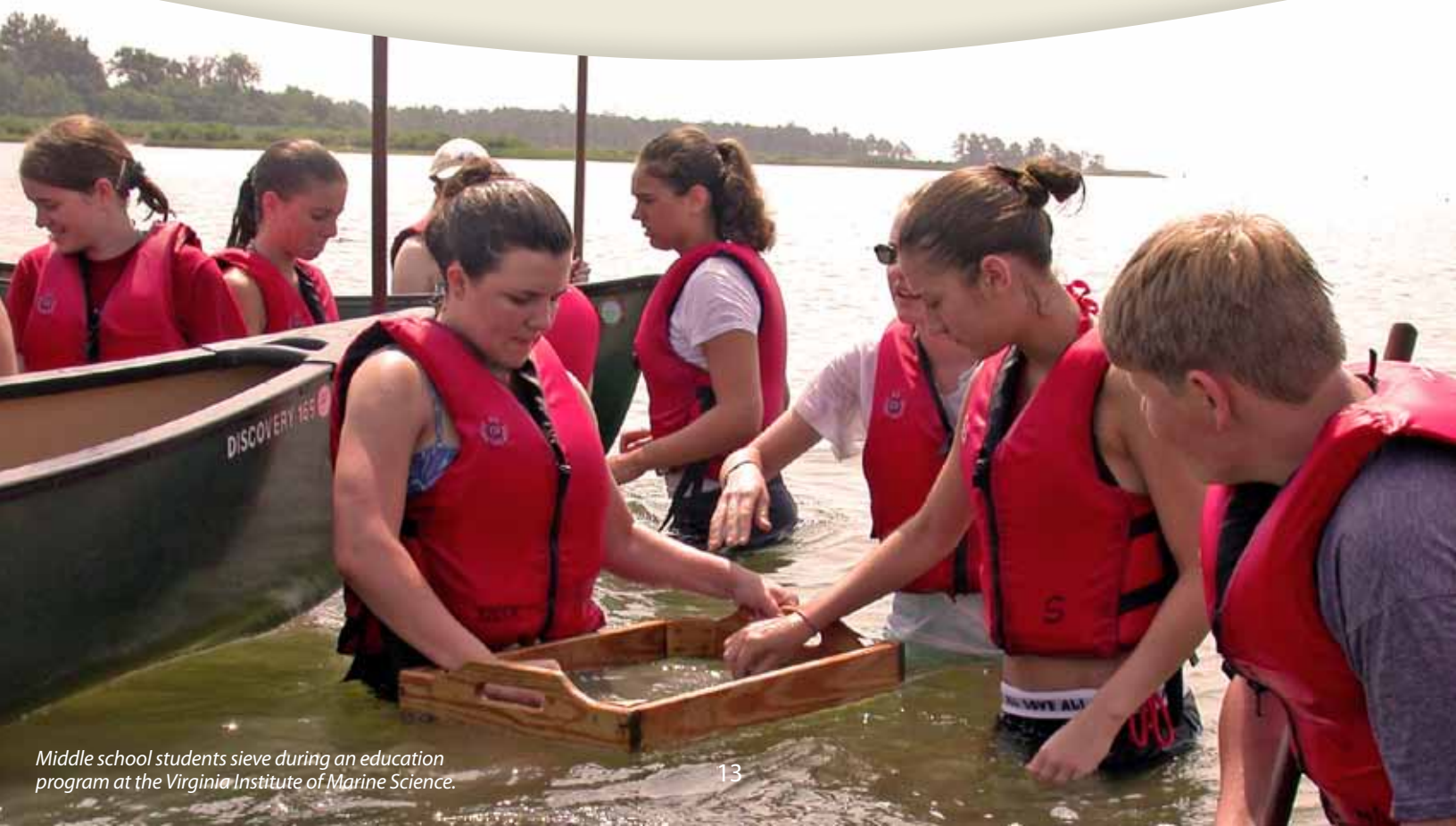
Middle school students sieve during an education program at the Virginia Institute of Marine Science.