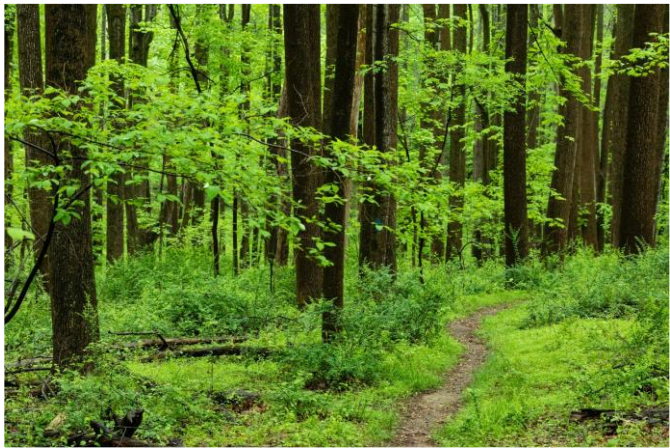
Patapsco Valley State Park

Protected Lands Outcome: By 2025, protect an additional two million acres of lands throughout the watershed – currently identified as high conservation priorities at the federal, state or local level – including 225,000 acres of wetlands and 695,000 acres of forest land of highest value for maintaining water quality.