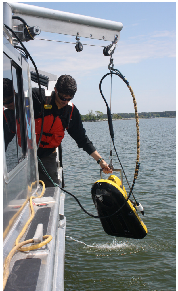
Data gathered using sonar helps scientists determine where planting oysters will be most effective.

In 2014, MD DNR plans to construct 33 acres of new oyster reef in the Little Choptank oyster sanctuary. These reefs will be built from a combination of fossil shell imported from Florida and granite. Rail transport of the shell was subsidized by CSX, working in partnership with the National Fish and Wildlife Foundation. Construction will likely occur in the fall of 2014.