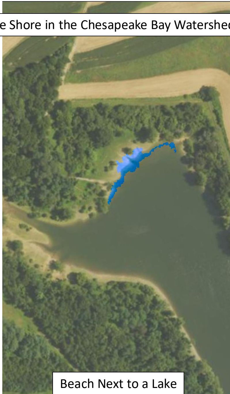
Beach Next to a Lake