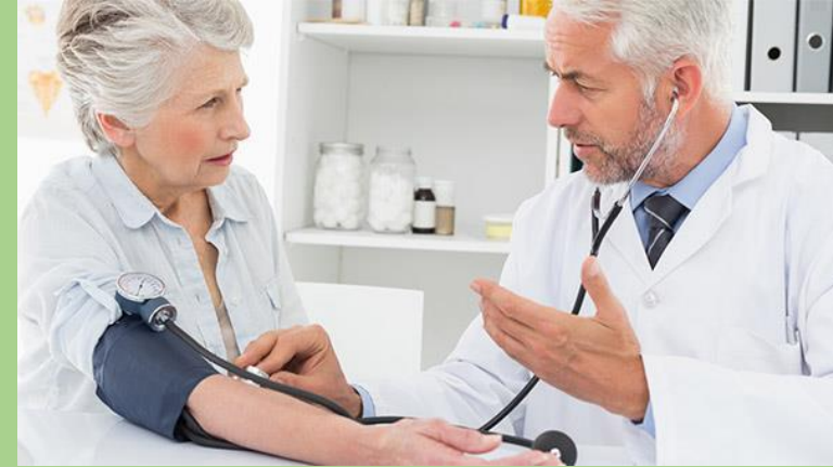
Understand the Needs