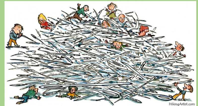
Database of Vetted Resources