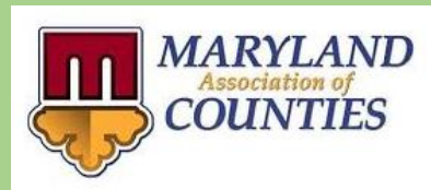
Delivery via Trusted Sources