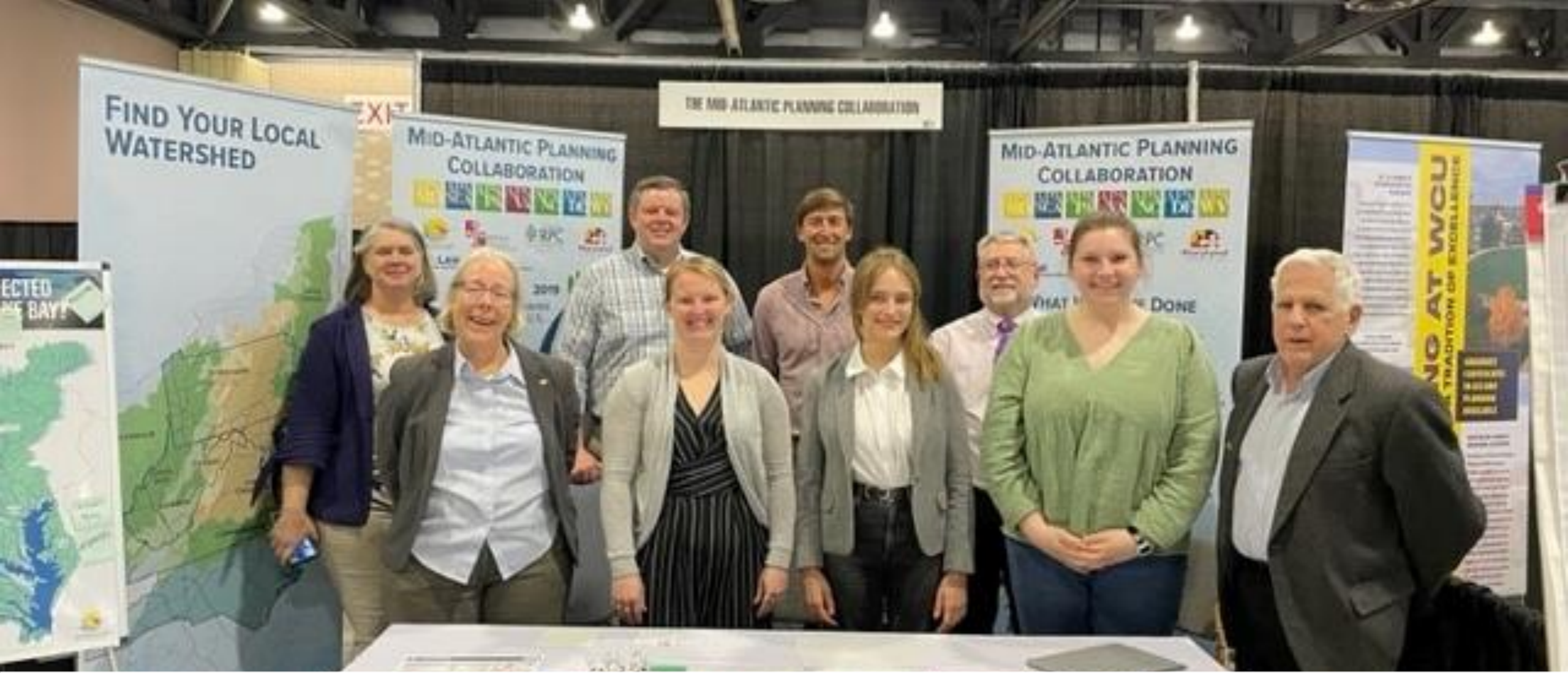
National Planning Conference, April, 2023, Philadelphia, PA