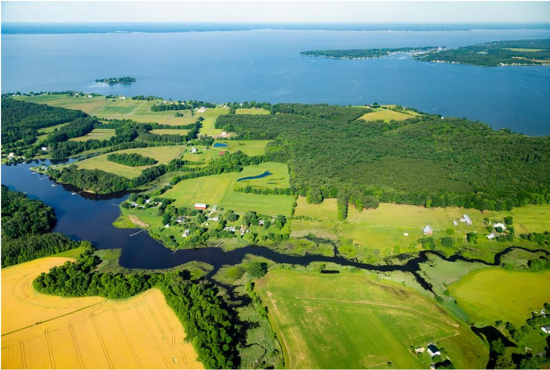
The Wicomico River, top, and Whites Neck Creek, bottom, flow toward the Potomac River in Charles County, Md., on June 5, 2018.