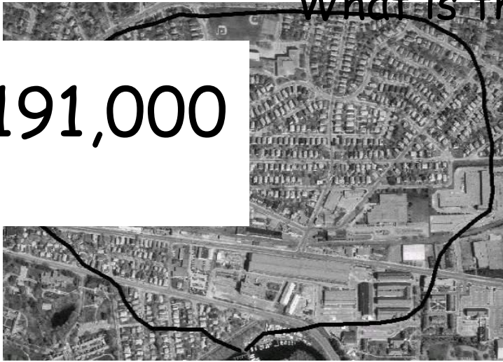
One Acre of IC of Urban Redevelopment