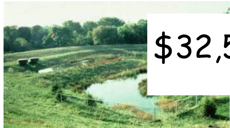
One Acre of IC with Storage Retrofits