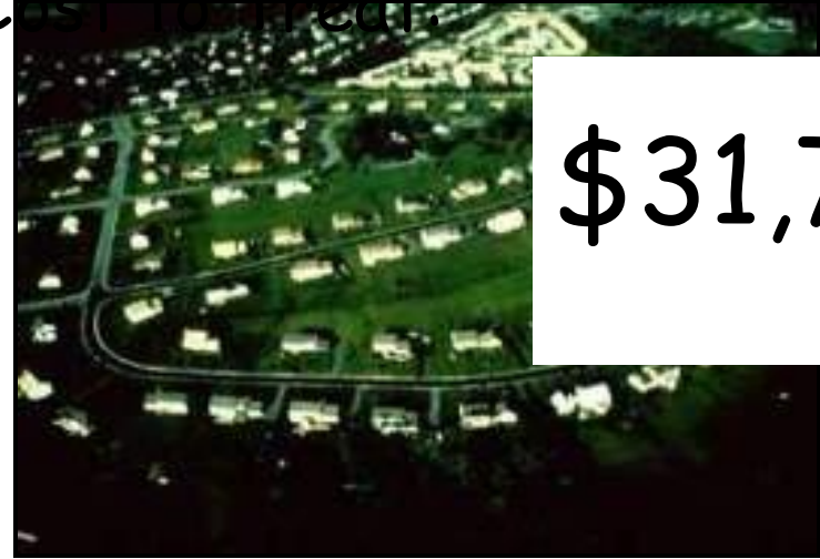
One acre of IC at Pre-ESD Greenfield Development