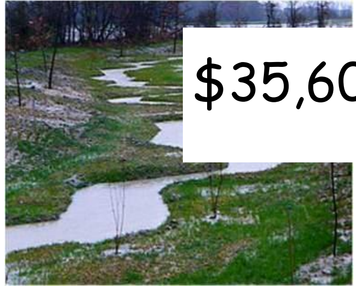
Stream Restoration in length equivalent to one acre IC, expressed in terms on nutrient load