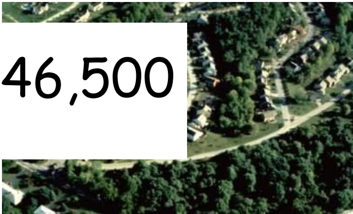
One acre of IC at Greenfield Development to ESD