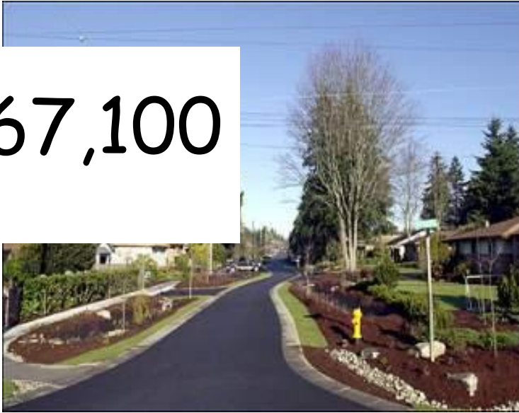
One acre IC with Green Streets