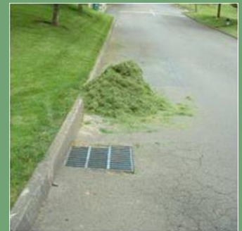
Keep clippings out of storm drain