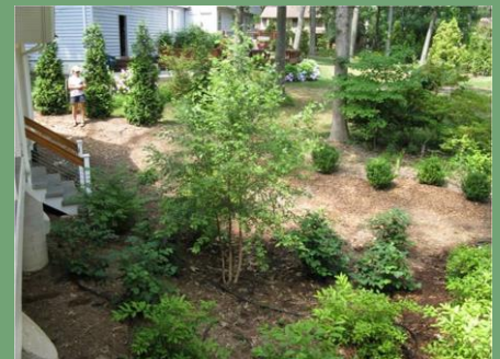
Conservation Landscaping instead of turf