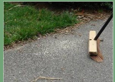
Sweep fertilizer off of pavement