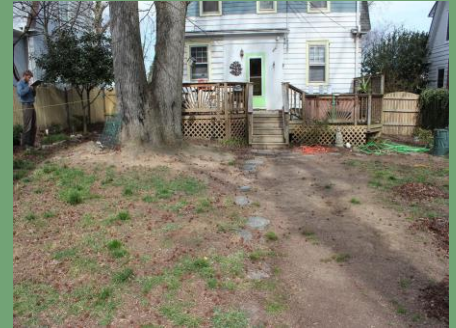
Maintain dense turf cover; avoid bare soils