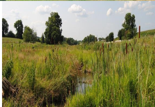
Figure 9. Pre-restoration (top) and post-restoration (bottom) photos of the Big Spring Run legacy sediment removal project in Lancaster, PA

The CBP legacy sediment removal workgroup 31 noted the following considerations related to riparian forests/trees and LSR projects: