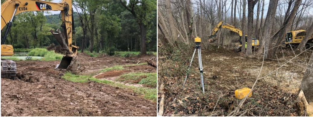
Figure 5. Stream restoration construction