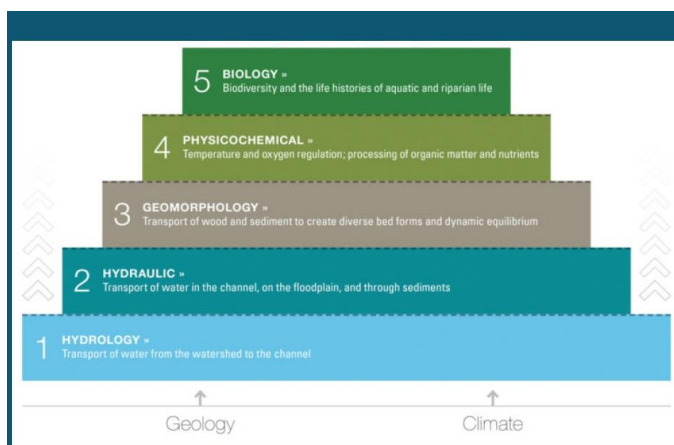
Figure 2. Stream Functional Pyramid (Harman et al., 2012), which is a widely used functional assessment process.

Establishing or maintaining a mature riparian forest may or may not be an appropriate and/or achievable goal for all sites or projects. Depending on current, historic, and projected future conditions, some stream restoration designs will not naturally evolve to become forested. In addition, some currently forested sites will evolve to conditions that do not include forest, often due to increased inundation and saturation of the floodplain. The project goals should be carefully considered by all stakeholders to determine if forested riparian conditions are appropriate.