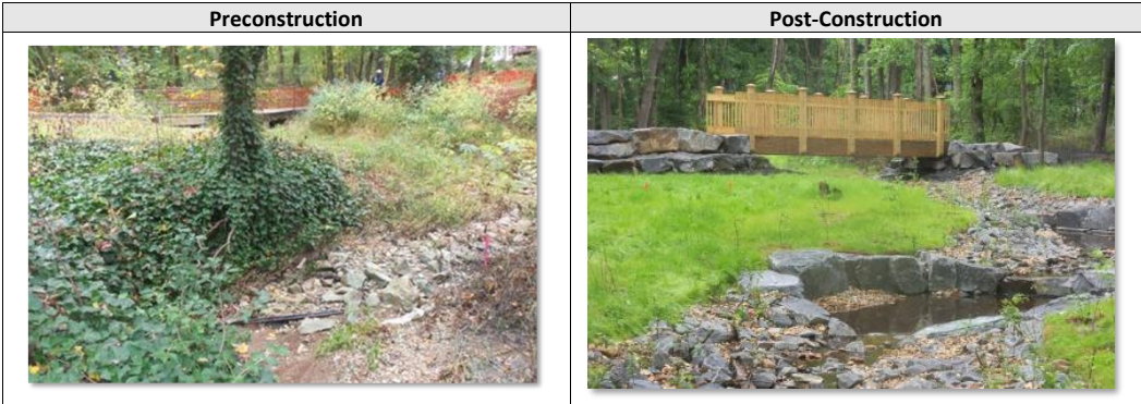
Figure 8. Pre- and post-construction photos of the Pohick Creek NCD project in Fairfax County, VA.

NCD guidance includes forest preservation and restoration, and a checklist has been developed for this purpose 30 that references the preservation of mature trees as part of permitting. Many state- and municipal-level agencies will have their own forest conservation plan requirements (refer to Table 1, Table 2, Table 3, and Table 4) that prevent unnecessary removal of trees, especially large/mature trees, but NCD itself does not focus as much on trees and forest areas as some believe it should. This may be partly due to the geographic region in which a lot of this work was done.