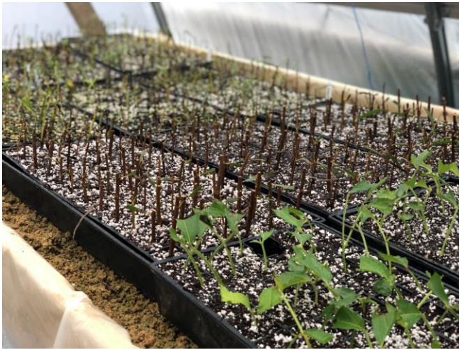
Figure 3. Nursery plantings

Ground-truthing is crucial for most projects at various stages of implementation, including initial assessment, and at any significant change points in the process. Sometimes survey data is inaccurate, incomplete, or otherwise corrupt. Also, the time across which many stream and riparian area projects take place is sufficient that it becomes important to for designers to refresh their memory of the site.