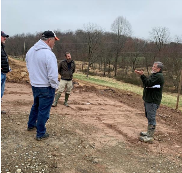
Figure 4. Design meeting with MD DNR during the concept development phase for a stream restoration project.

existing riparian resources, before a final design is committed to and a great deal of money is spent. This early feedback also helps to identify aspects of the proposed project that may affect permit approval and possible alternatives to streamline the approval process.