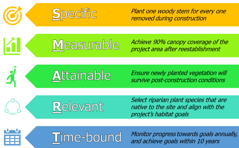
Figure 1. Example of a SMART goal for maintaining riparian vegetation in stream restoration projects. SMART goals are Specific, Measurable, Attainable, Relevant, and Time-bound 15 .

To determine appropriate goals and objectives, it is necessary to identify the cause of stream degradation by comparing the current condition of a stream to historical conditions, and then projecting its future conditions under different restoration scenarios. This important step is often abbreviated or overlooked, resulting in many failed or poorly performing restorations. When restoring streams to a given historical condition is an objective, care must be taken to ensure that physical or biological changes in the watershed have not prohibited a return to that historical condition. In many cases, restoration projects are actually rehabilitations since not all ecologically self-sustaining functions and values can be restored to the stream 16 .