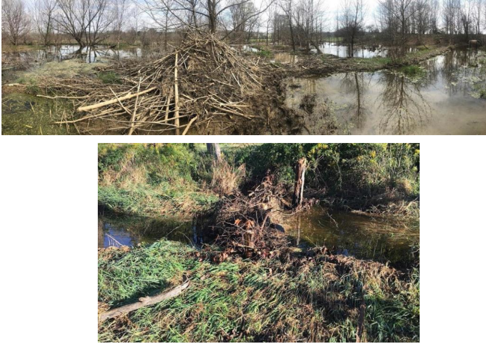
Figure 10. Two examples of beaver dams and their influence on the surrounding environment

BDA installation can help combat stream channel erosion and entrenchment by promoting sediment deposition. Beaver dams have also been shown to improve floodplain connectivity, attenuate flows, and increase habitat complexity 36,37 .