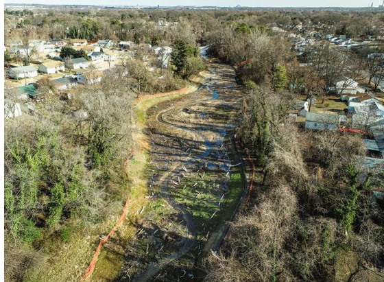
Figure 7. Pre- and post-construction photos of the Furnace Creek floodplain reconnection project in Anne Arundel County, MD.

Unintended consequences identified by the Protocols 2 and 3 work group 22 include: