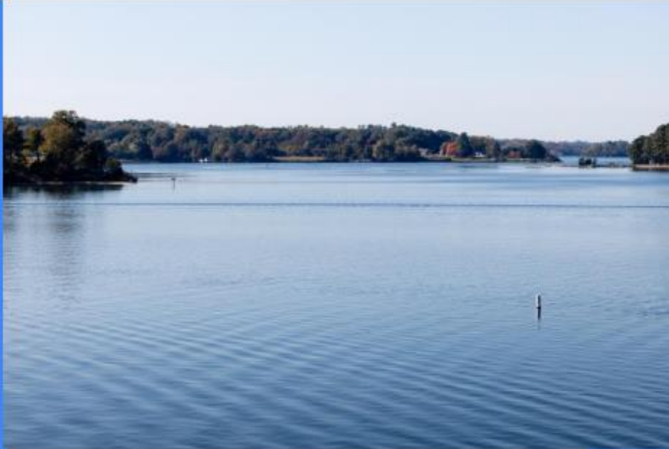
Buoys mark the underwater locations of reconstructed oyster reefs on the upper St. Mary's River near St. Mary's College in St. Mary's City, Md., on Oct. 21, 2022.

Elected THREE new at-large members & TWO new leadership positions.