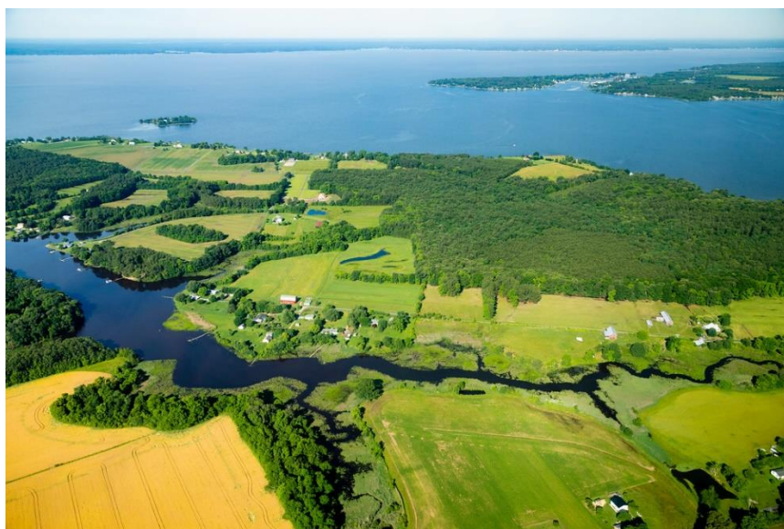
The Wicomico River, top, and Whites Neck Creek, bottom, flow toward the Potomac River in Charles County, Md., on June 5, 2018.