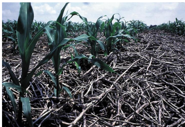
Figure A-3-1. Corn growth with crop residue.

Conservation tillage involves the planting, growing and harvesting of crops with minimal disturbance to the soil surface through the use of minimum tillage, mulch tillage, ridge tillage or no-till. The amount of crop residue coverage is higher and soil disturbance is lower when compared to conventional or high tillage methods. Greater crop residue coverage and lower disturbance to the soil surface protect against the erosive forces of wind and precipitation.