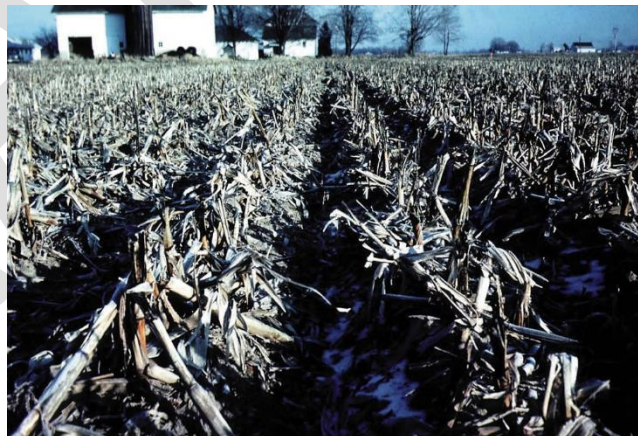
Figure A-3-2. Ridge till rows.

Conservation Tillage ( Mulch Tillage, Ridge Tillage, No Tillage ): A conservation tillage routine that involves the planting, growing and harvesting of crops with minimal disturbance to the soil in an effort to maintain 30 to 59 percent crop residue coverage immediately after planting each crop. Some common practice that qualify under this definition are: NRCS practice code 345; mulch tillage as defined by the CTIC, and; ridge tillage as defined by CTIC.