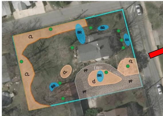
Figure 2: Aerial Photo of the Old House Example and Tom's UNM Pledge.

Tom has an old house on a half acre lot in Bay County. He wants to make a difference in the Bay, so he contacts Joe at Bay County who conducts an on-site visit to assess homeowner BMP potential on his property. Based on the assessment, Tom builds five rain gardens that treat all of his rooftop runoff, installs a permeable driveway, and signs a pledge to follow the core urban nutrient management practices on his lawn (see Figure 2).