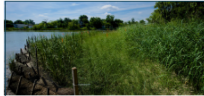
An urban tidal wetland project in Norfolk, Virginia uses coconut fiber logs to control erosion.

Safety and Floodplains: Floodplains, which include wetlands, are vital for mitigating the impacts of coastal storms and flooding. Communities participating in the Community Rating System program can reduce the cost of flood insurance premiums by preserving green spaces including floodplains, living shorelines and wetlands.