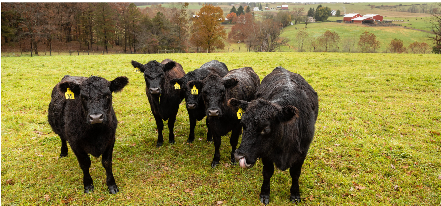
Cattle are grazed rotationally at Pine Draft Farm, seen in Hampshire County, W.Va.