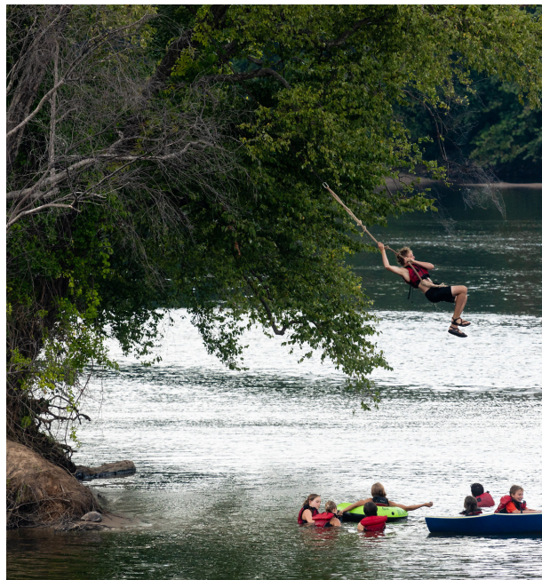
Visitors cool off in the James River amid 90-degree temperatures in Richmond, Va., on Aug. 13, 2019. Between 2010 and 2018, Chesapeake Bay Program partners opened 176 new places to swim, fish, boat, kayak or otherwise enjoy the water. This is a 59% achievement of our goal.

Underwater grasses: In 2018, 91,559 acres of underwater grasses were mapped in the Chesapeake Bay. However, 22% of the Bay was not fully mapped due to prolonged turbidity, weather conditions and security restrictions. Using 2017 levels for these unmapped areas, it is estimated that the Bay may have supported up to 108,960 acres of underwater grasses in 2018. This would be a 4% increase from 2017 figures and a 59% achievement of the partnership's 185,000-acre goal.