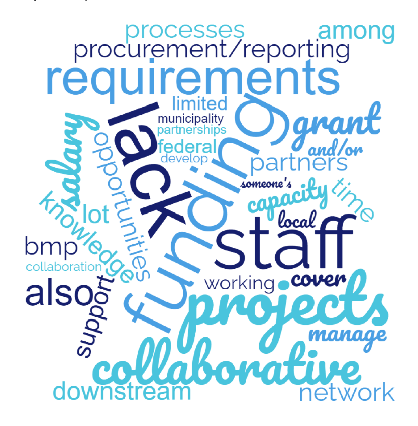
Question 4: My organization is interested in federal funding opportunities like the Inflation Reduction Act and others. [Yes, No, Don't Know]

Question 3: If you marked 'Other' above please elaborate. (Word cloud below generated from responses)