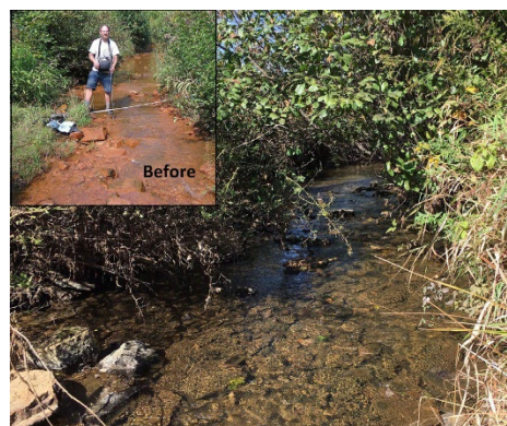
Section 319 funds helped address acid mine drainage (top left) from abandoned mine sites in West Virginia’s Deckers Creek watershed. (For details, read the success story .)

NPS pollution is the dominant source of water quality pollution and the leading cause of impaired waters in the United States. Our nation’s water quality challenges continue to grow with increasing population and changing land use and climate conditions. For more details about NPS pollution, see the EPA’s Polluted Runoff: Nonpoint Source (NPS) Pollution website .