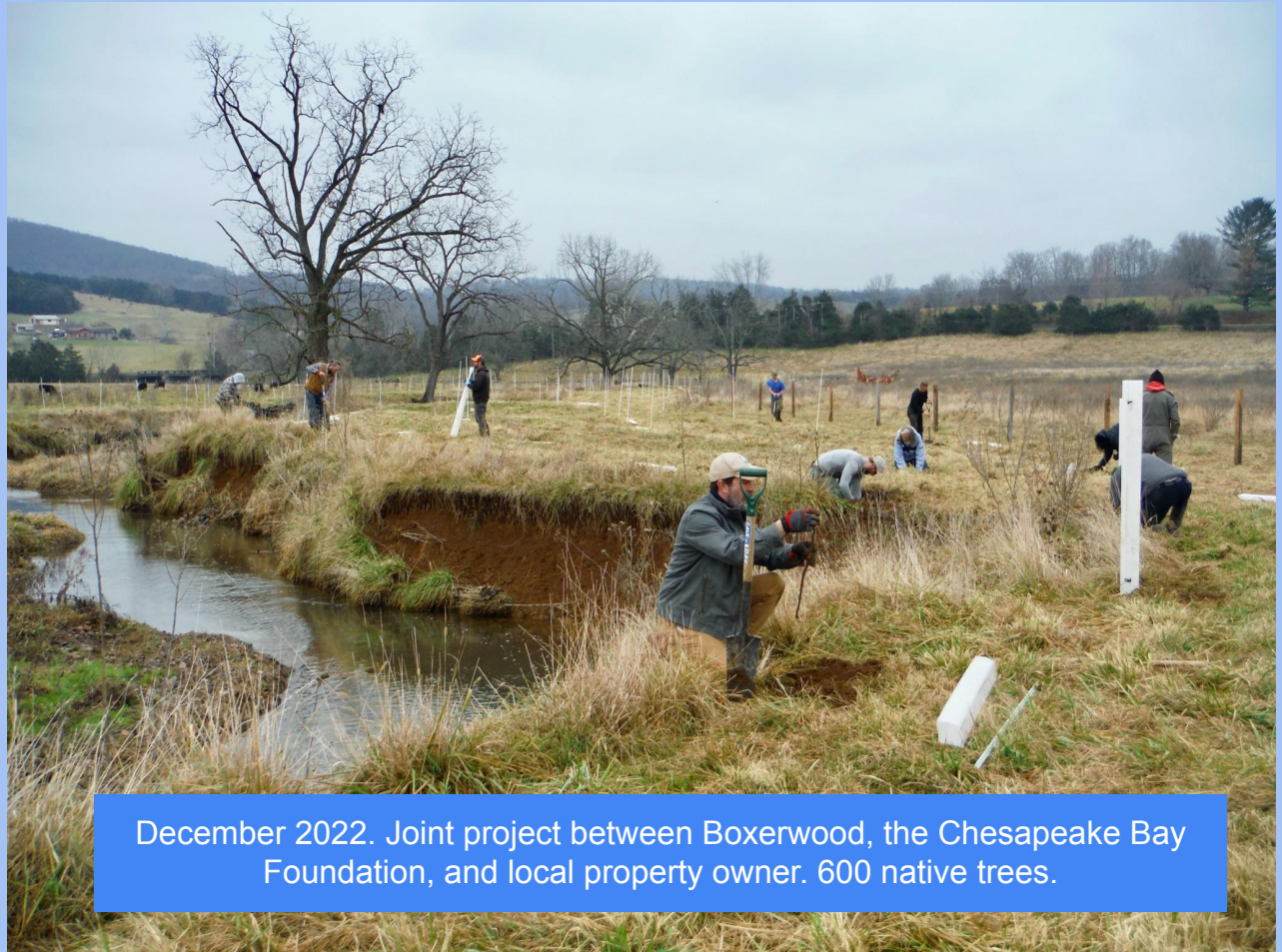
December 2022. Joint project between Boxerwood, the Chesapeake Bay Foundation, and local property owner. 600 native trees.