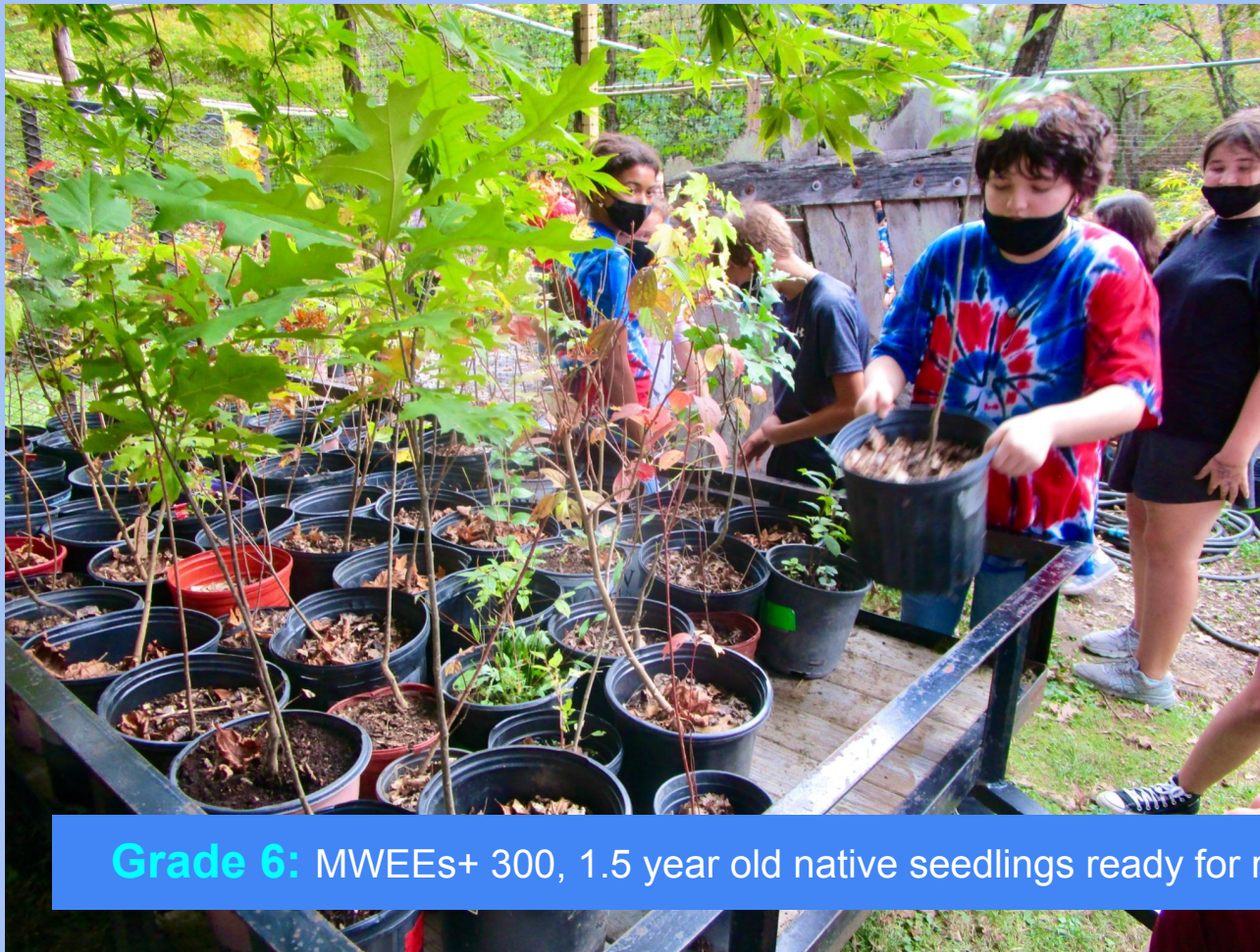
Grade 6: MWEEs+ 300, 1.5 year old native seedlings ready for replanting each year.