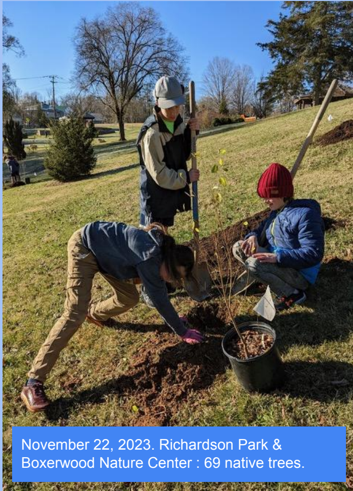
November 22, 2023. Richardson Park & Boxerwood Nature Center : 69 native trees.