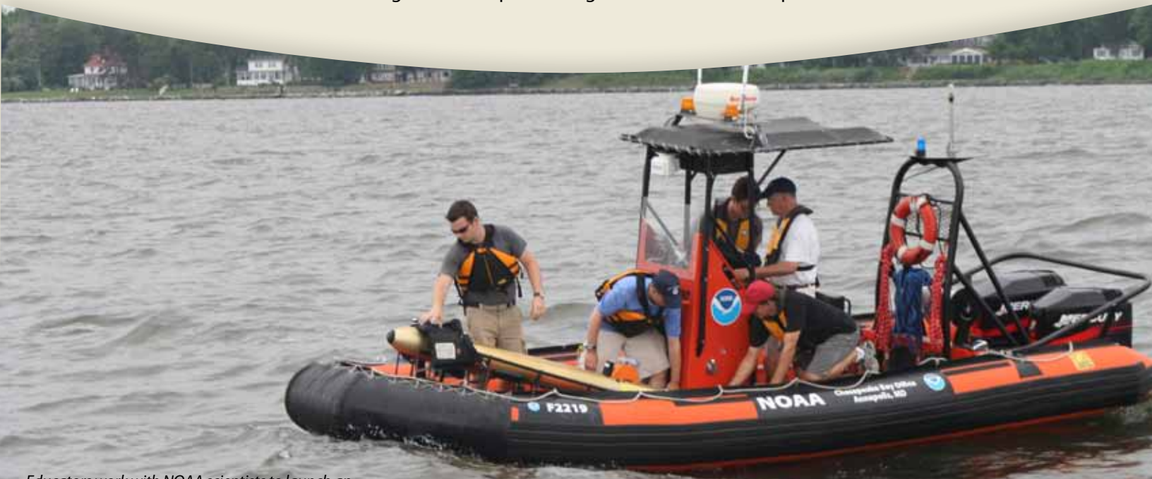
Educators work with NOAA scientists to launch an autonomous underwater vehicle during a professional development workshop in Annapolis, Maryland.