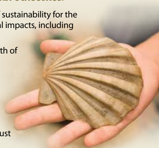
Photo of fossilized scallop shell

Outcome 4.3: Federal, state, and nongovernmental organizations with PK-12 programs actively communicate to increase collaboration related to environmental literacy planning and implementation.