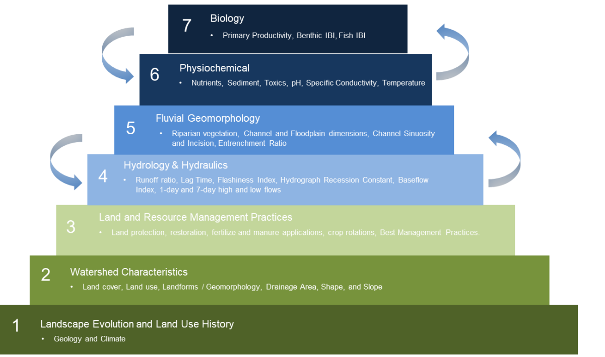
adapted from Stream Mechanics