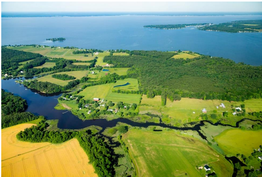
The Wicomico River, top, and Whites Neck Creek, bottom, flow toward the Potomac River in Charles County, Md., on June 5, 2018.