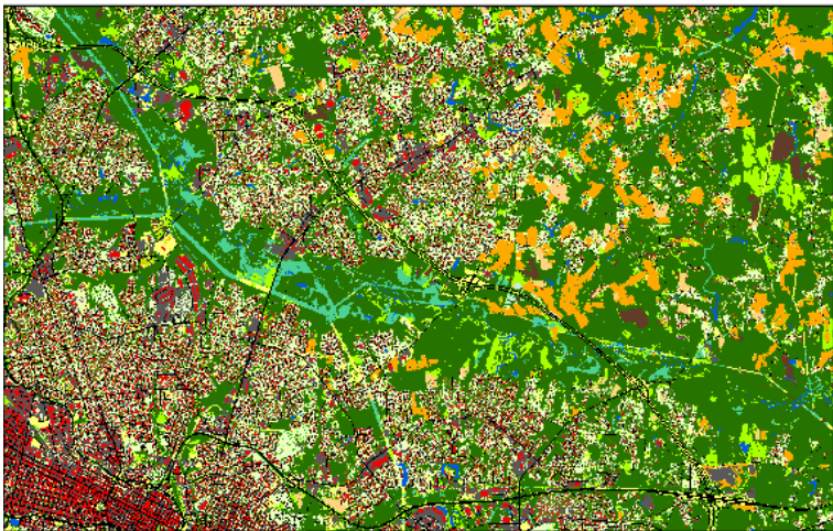
High-resolution LULC 56 classes

Mapped from aerial imagery, Light Detecting and Ranging (LiDAR), and ancillary data sources.