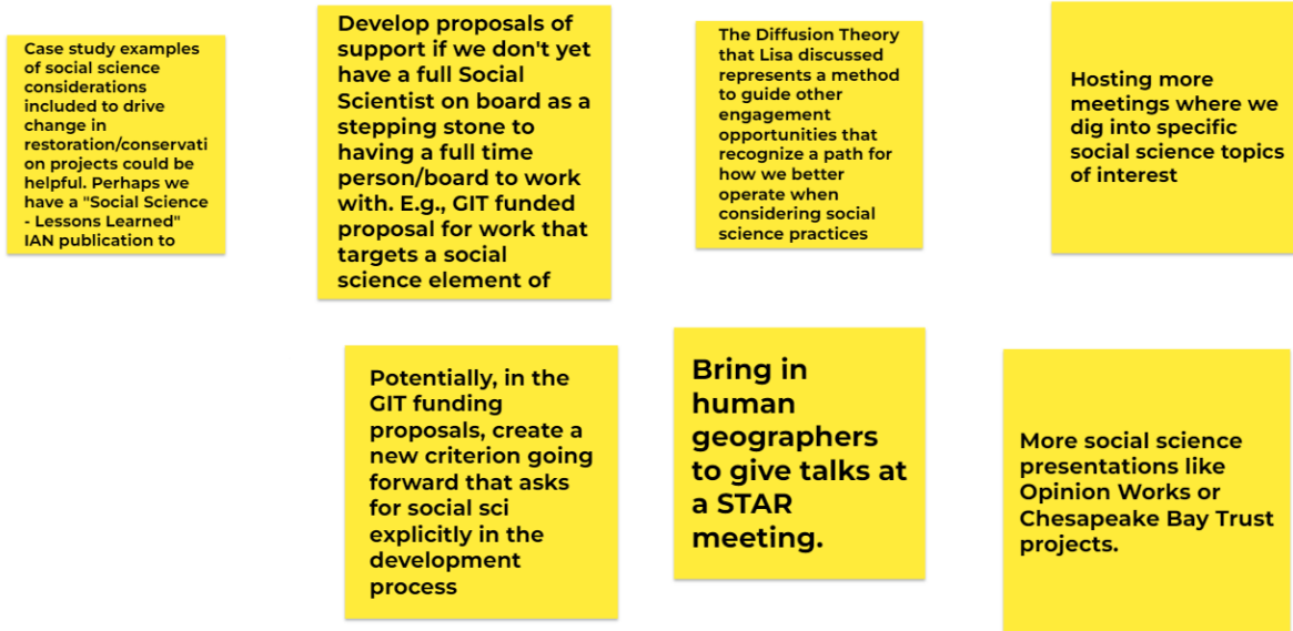
Image Description: How can STAR provide science support for application of social science? Responses: