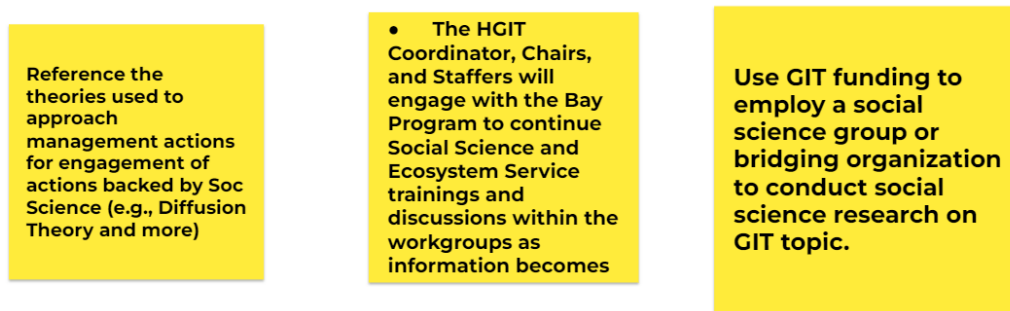
Image Description: How can GITs incorporate Social Science into their efforts? Responses: