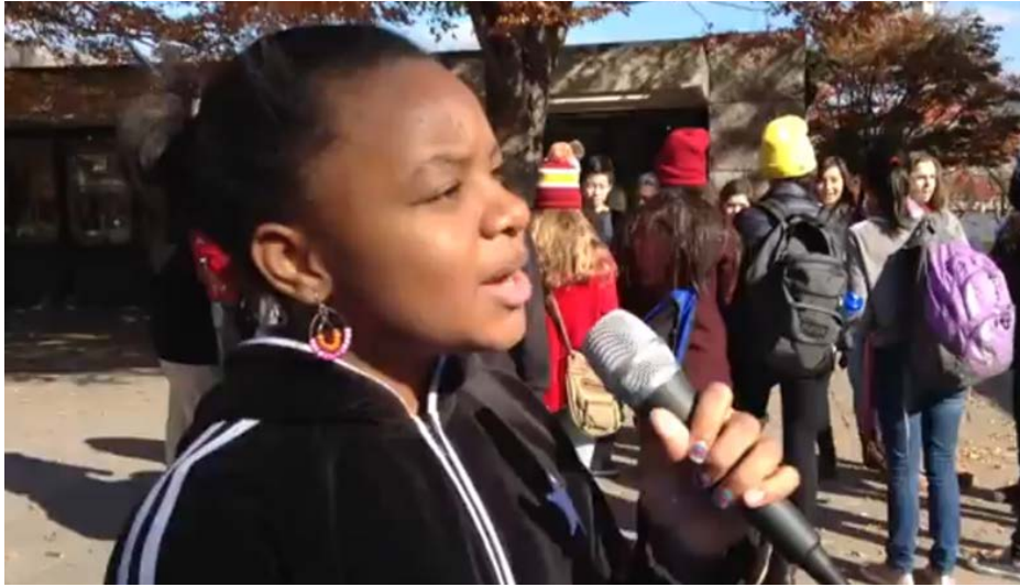
6 th grade Accokeek Academy students at the National Mall