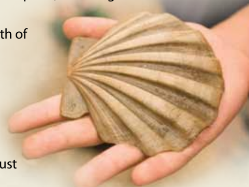
Photo of fossilized scallop shell

Outcome 4.3: Federal, state, and nongovernmental organizations with PK-12 programs actively communicate to increase collaboration related to environmental literacy planning and implementation.