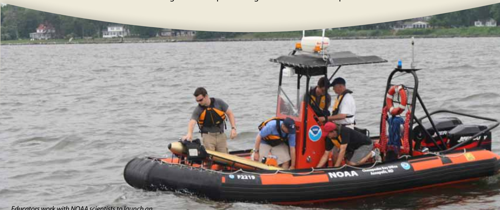
Educators work with NOAA scientists to launch an autonomous underwater vehicle during a professional development workshop in Annapolis, Maryland.