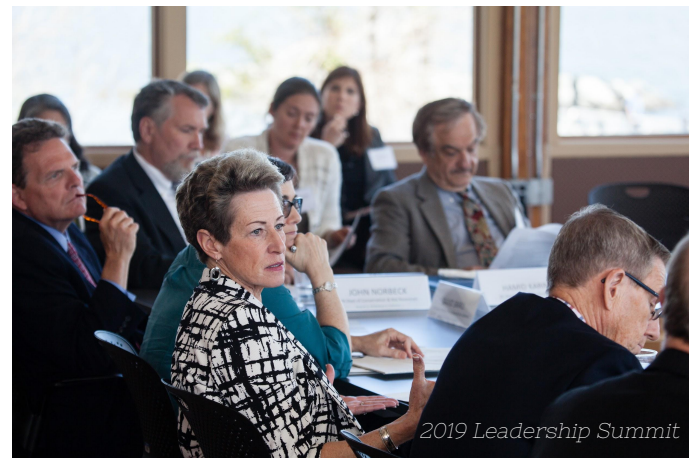
2019 Leadership Summit