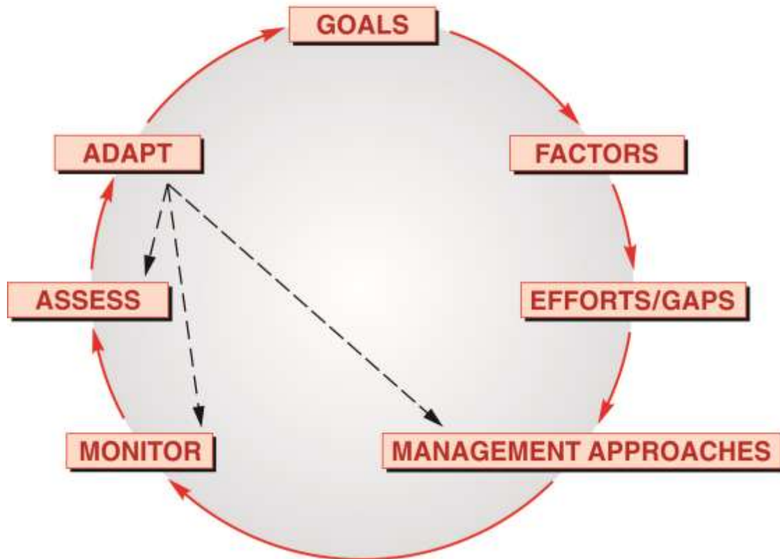
Figure 2: CBP decision framework that will be used to develop and implement management strategies

To be most effective, it is important for the GITs to understand how STAC and STAR plan to advise them during the development of their management strategies. Through collaboration, STAC and STAR will work together to assist each GIT during this process. Below is how each group plans to advise the GITs.