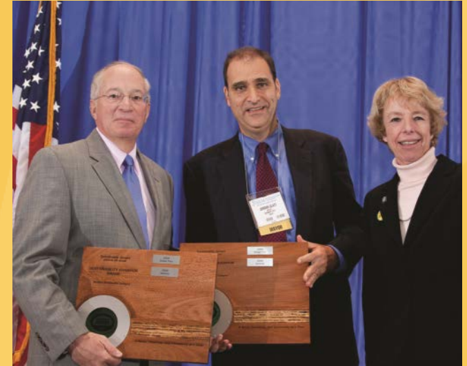
Sustainability Champion award