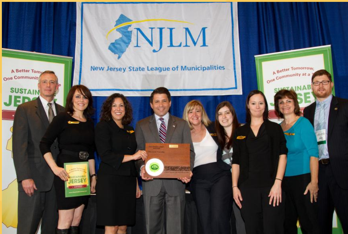
Gloucester achieves Sustainable Jersey certification