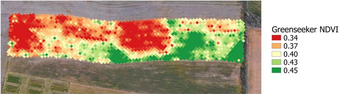
Figure 1. An interpolated surface of GreenSeeker NDVI readings at cover crop burndown.