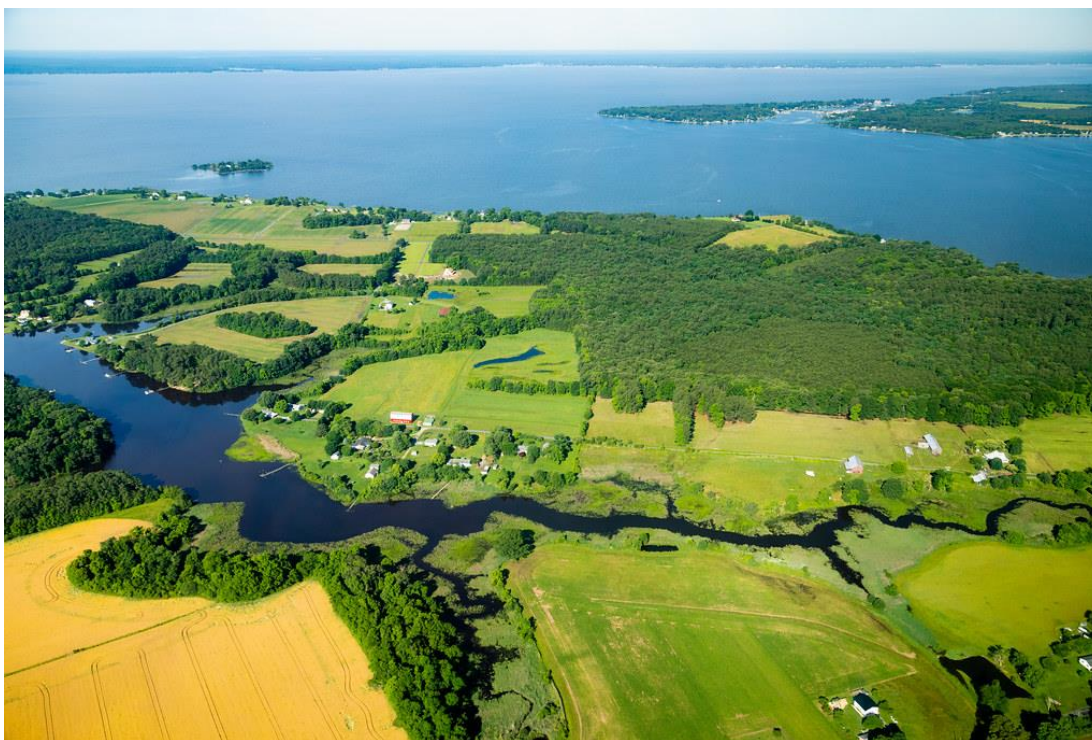
The Wicomico River, top, and Whites Neck Creek, bottom, flow toward the Potomac River in Charles County, Md., on June 5, 2018.